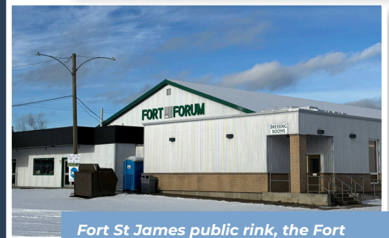
Fort St. James public rink, the Fort Forum, where free public skating and power skating sessions will be held winter 2025/26