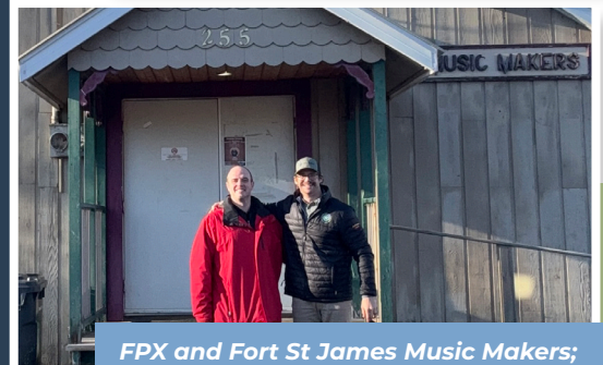
FPX and Fort St. James Music Makers; FPX provided support with a donation supporting youth access to plays for the fall and winter months